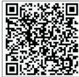
Kranti HD C Type 9 Tine DF